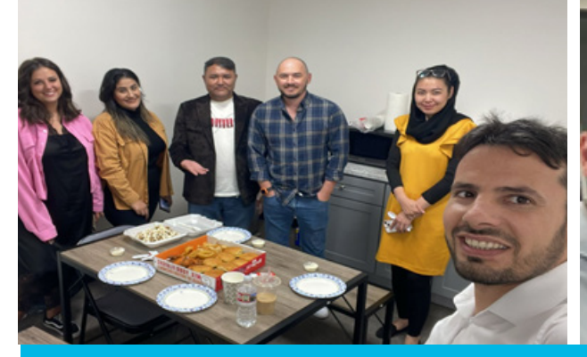
October 16 New office first lunch together