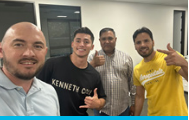
October 3 Sacramento Office move-i