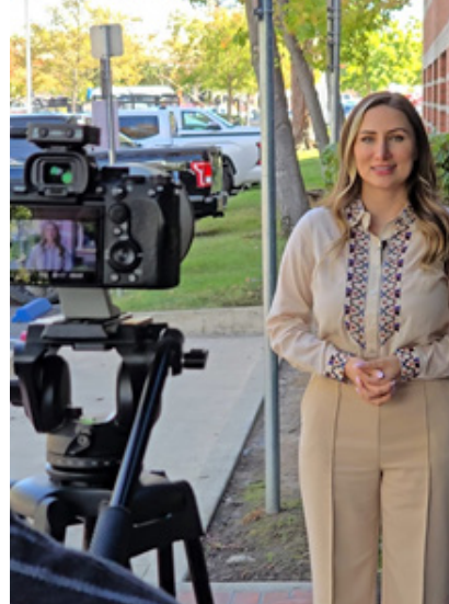
October 2 Matching day