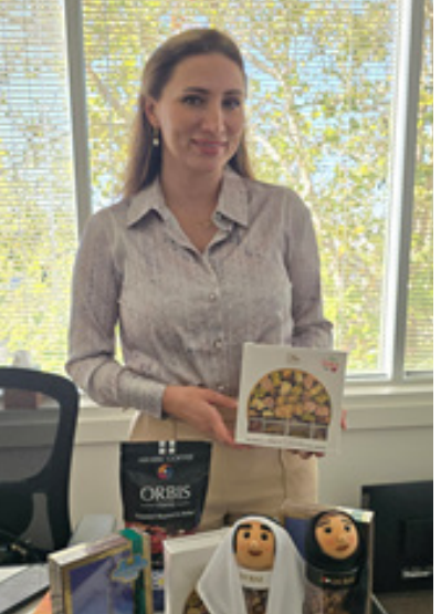
October 8 Hi from Dubai!