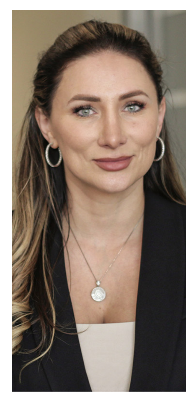
Wishing you all a fantastic November 2024 and continued success. Keep up the great work!

As we look forward to the coming month, let's carry this momentum forward with renewed energy and inspiration.