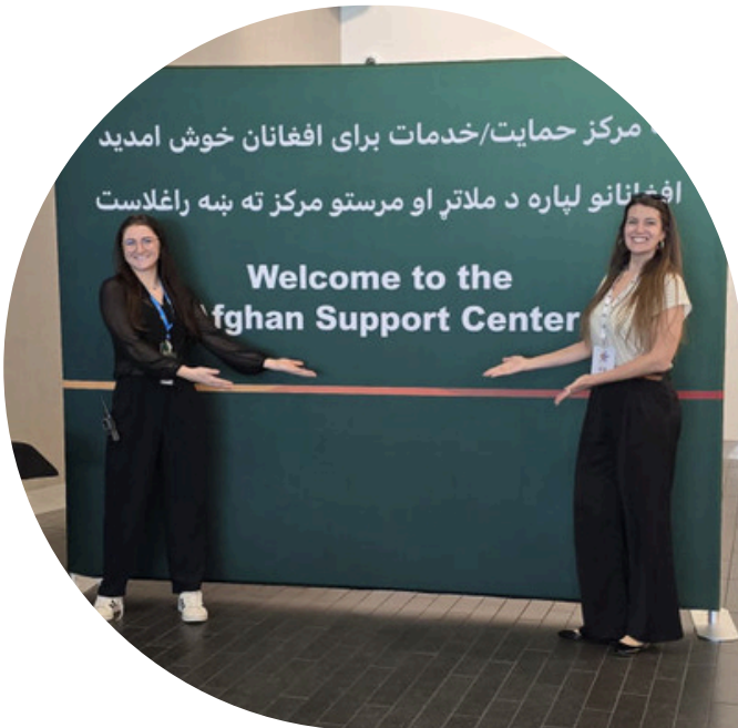
Sacramento Afghan Support Center Week