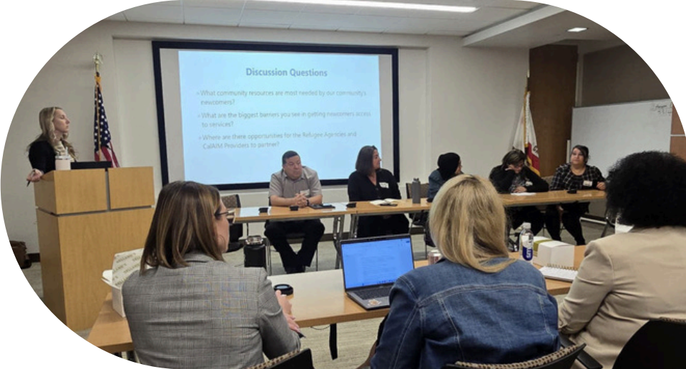
Educational Training for MediCal Providers and partners