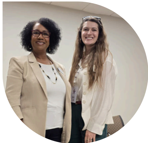
Great to meet our MCP partners here - Anthem Blue Cross, Molina, Health Net, Partnership, and Kaiser. It's a pleasure to work together in support of our communities!