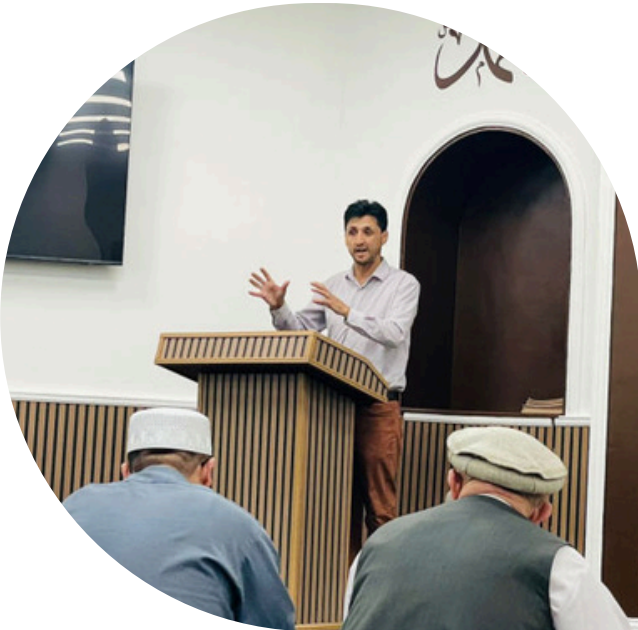
Dinner with families in Masjid Emam-e-Azam