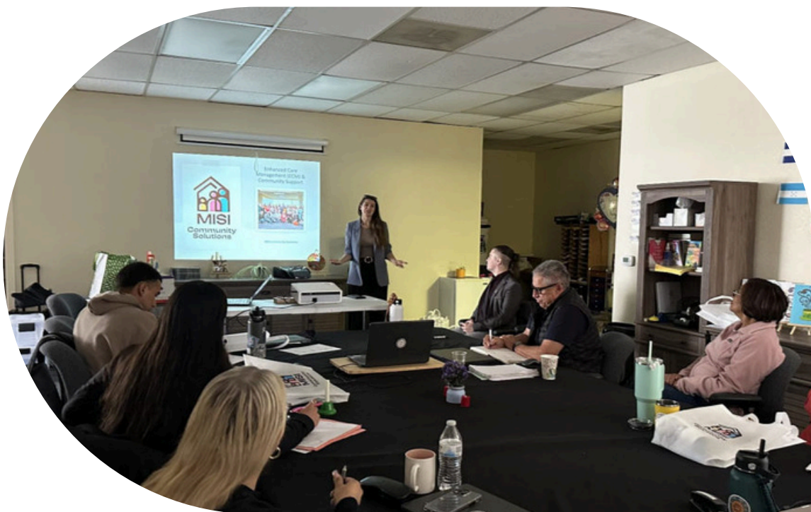
Introduction of MISI Services to the Latino Leadership Council Team