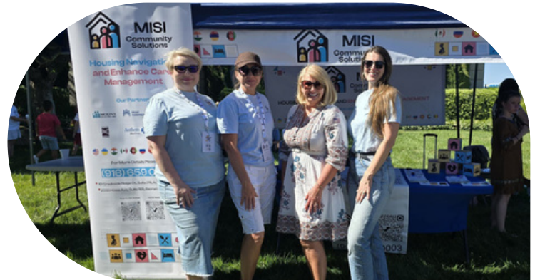
Cultural Festival at Community Outreach Academy