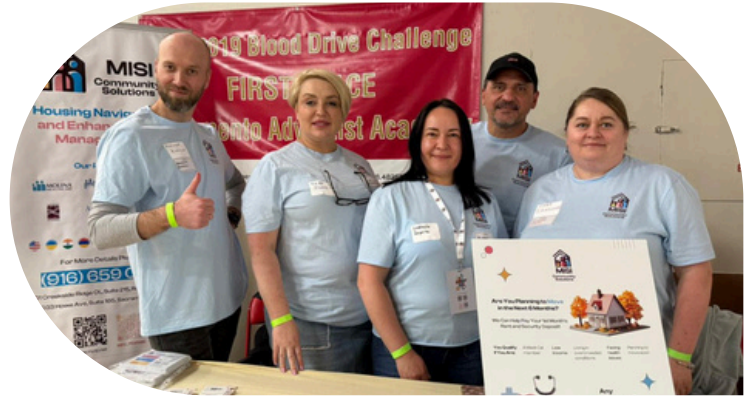
Volunteering for the Free Community Clinic