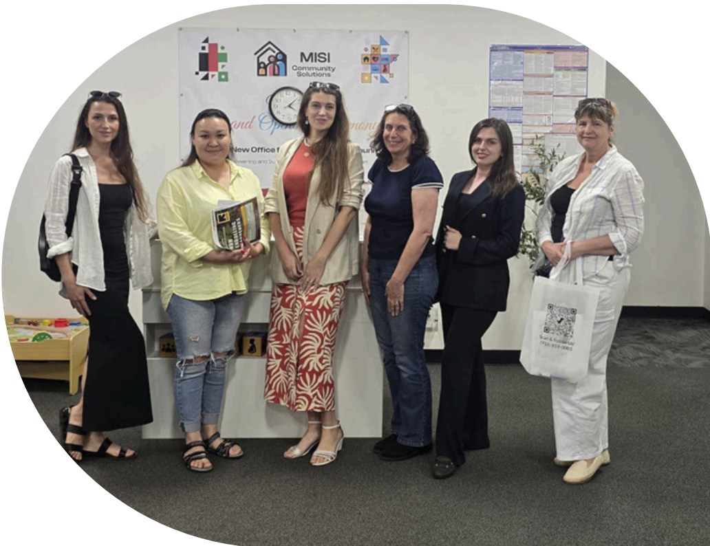
Smart Shopping Workshop Presented by our partners from IRC