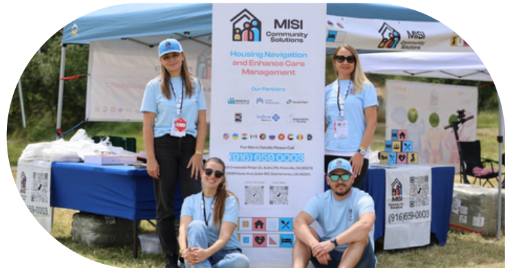
Vendors at Mriya Fest