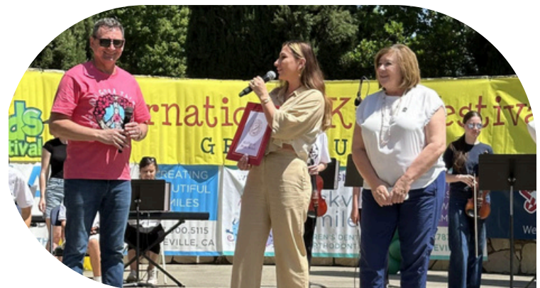
International Kids Fest