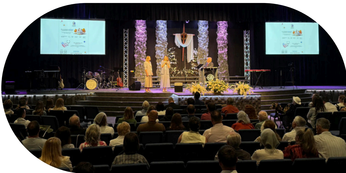
Community Outreach - Grace Avenue Bible Church