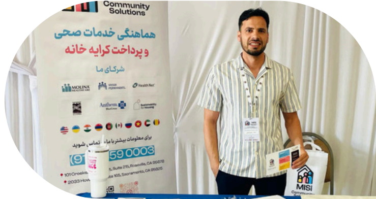
Highlands Community Charter and Technical School Resource Fair