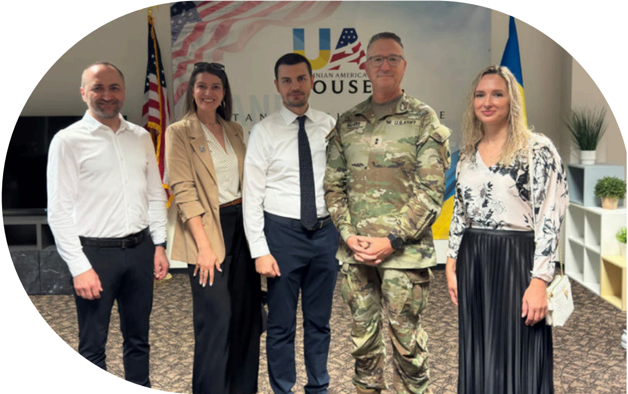
MISI Representatives were invited for Coffee with the Ukrainian Consulate